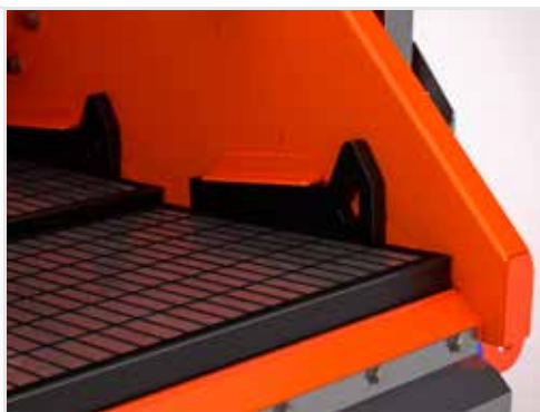
Patented ultra-tight seal between screen and screen bed