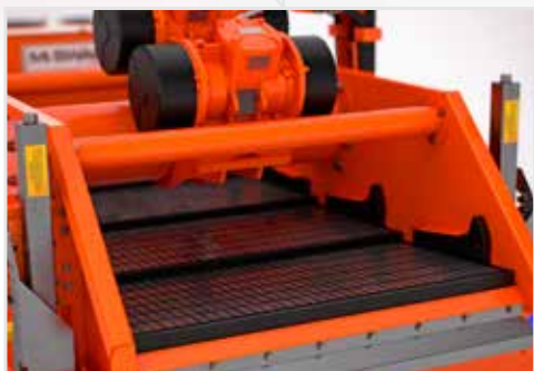
Largest non-blanked screen area among shakers of similar footprint: 21.2 ft 2 (1.97 m 2 )