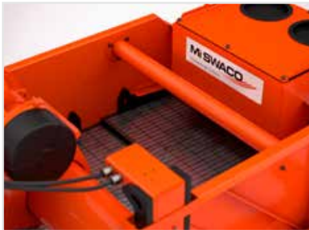
Increased access for inspection, installation, and removal of screens