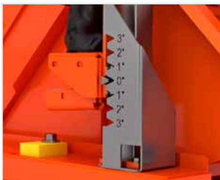
Deck angle can be adjusted while processing fluid. Adjustment Range is -3° to +3°