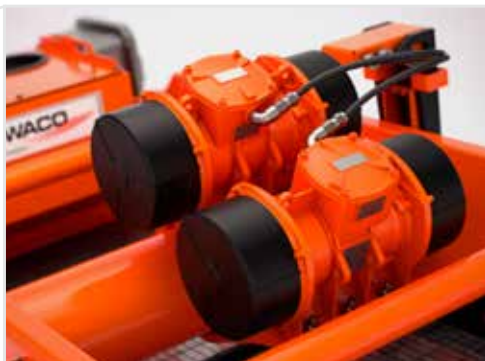
Two oilfield proven 2.5 HP motion generators