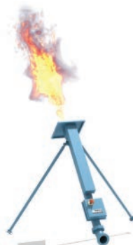
Gas Vent Line Igniter