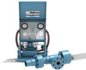
Hydraulic Drilling Choke