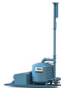
Ecological Containment System