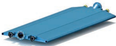
Vent Line Drive-Over